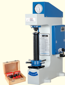
ROCKWELL HARDNESS TESTING MACHINES ( Model : MRS )