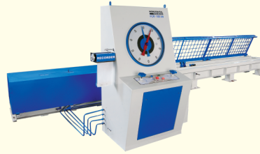
HORIZONTAL CHAIN & ROPE TESTING MACHINES ( Model : FCR, FCR-E, FCR-EC )