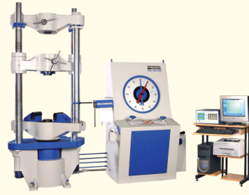
ANALOGUE CUM COMPUTERISED - U.T.M. ( Model : TUE-CN )