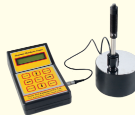
PORTABLE DYNAMIC HARDNESS TESTING MACHINES ( Model : DHT-6 )