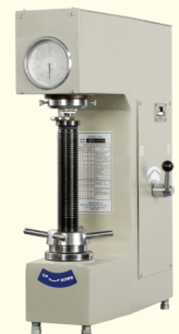
LATEST STANDARD ROCKWELL HARDNESS TESTING MACHINES ( Model : MRS-N )