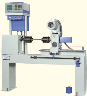
DIGITAL TORSION TESTING MACHINES ( Model : MTT-E )