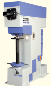
OPTICAL BRINELL HARDNESS TESTING MACHINES ( Model : OPAB-3000 )