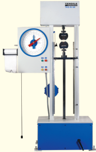
ANALOGUE - TENSILE TESTING MACHINES ( Model : TKG )