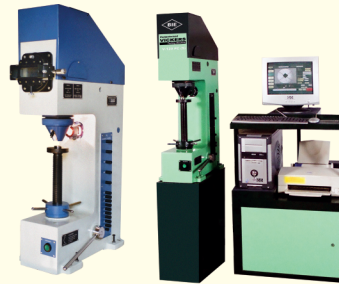
VICKERS CUM BRINELL HARDNESS TESTING MACHINES ( Model : BV )