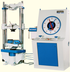
ANALOGUE - UNIVERSAL TESTING MACHINES ( Model : TUN )