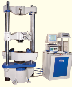
COMPUTERISED U.T.M. ( Model : TUE-C )