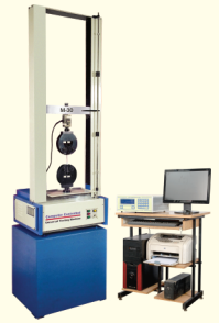
COMPUTER CONTROLLED BALL-SCREW DRIVEN U.T.M. ( Model : M SERIES )