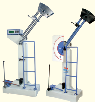
PENDULUM IMPACT TESTING MACHINES ( Model : AIT-300-N, AIT-300-EN, AIT-300-D, AIT-300-ASTM )