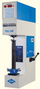
DIGITAL ROCKWELL HARDNESS TESTING MACHINES ( Model : TRS-DM )