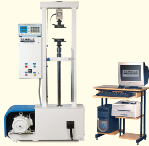
COMPUTERIZED - TENSILE TESTING MACHINES ( Model : TKG-EC )